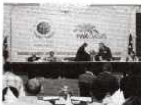
PHOTO GLIMPSES OF THE SIGNING CEREMONY