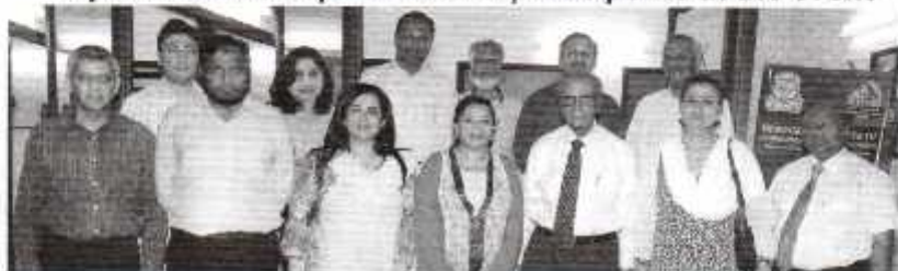
A group photo of speakers at the event