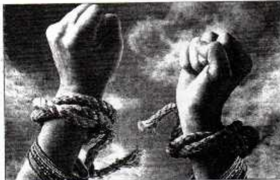
market place and community.