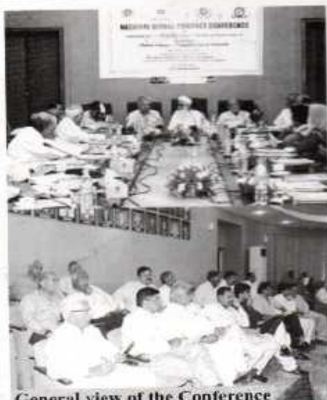
General view of the Conference