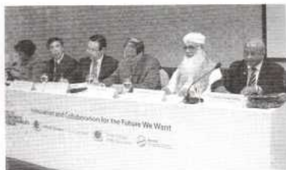
The Moderators and Speakers during the two sessions of the Pakistan Event at Rio