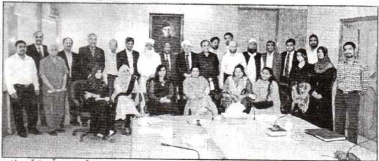
کراچی: فیڈریشن آف پاکستان چیئرمین آف کامرس اینڈ انڈسٹری میں گھوٹل کمیٹی پاکستان کے لوکل سٹوڈنٹ ورک کے ذریعہ اہتمام 36 ویں تجارتی میٹنگ کے موقع پر لیا گیا گروپ فوٹو