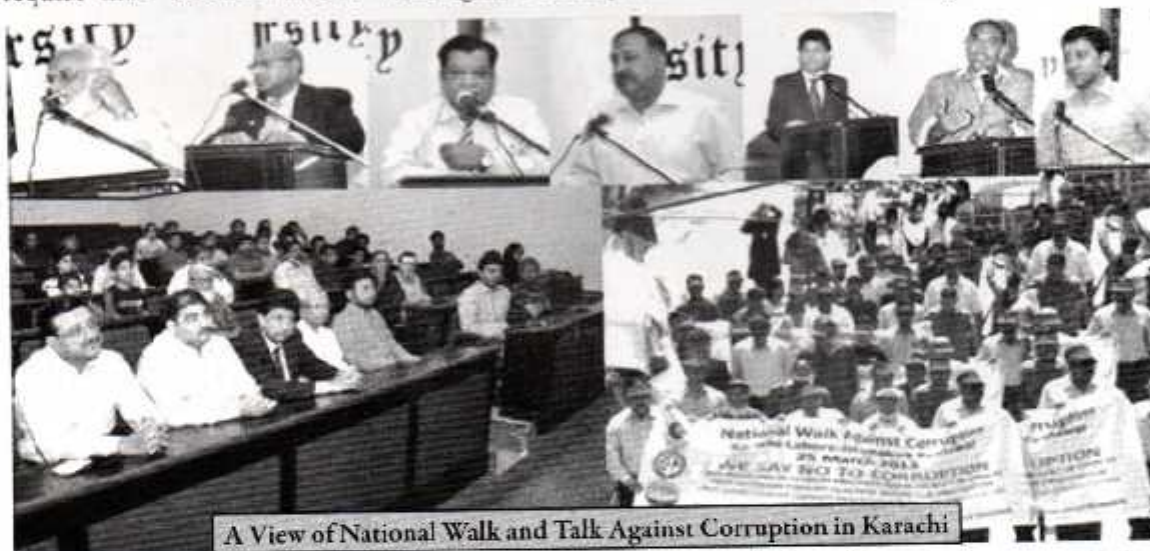
A View of National Walk and Talk Against Corruption in Karachi

The object of the Seminar and the walk was to effectively convey the collective desire of business to combat the evil affects of corruption on business and society and to integrate and promote the principles of UN Global Compact relating to anti corruption which require that "Business should work against corruption in all forms including extortion and bribery.