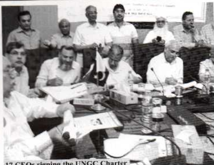
17 CEOs signing the UNGC Charter