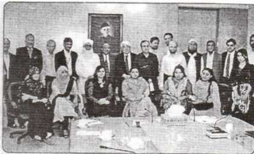
کراچی: فیڈریشن چیئرمین میں گھوٹل کمیٹی پاکستان کے ذریعہ اہتمام اجلاس کے موقع پر گروپ فوٹو