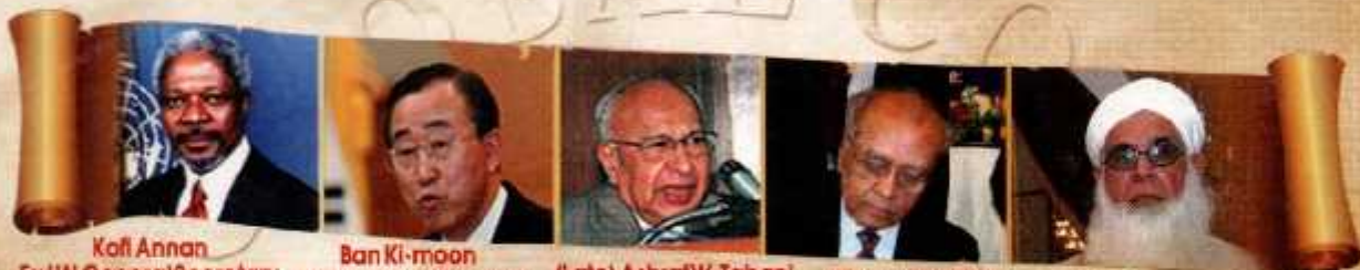
Kofi Annan Ex UN General Secretary

Pakistan Network Intro / Activities / Future Plan Report at UNGC World Summit NY 2010