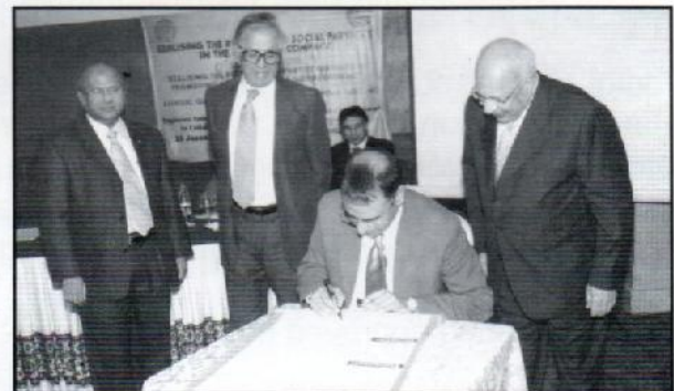
HR Manager of Attock Refinery Rawalpindi signing the Charter of Global Compact.