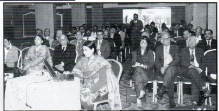
A pictorial view of Annual Network Review meeting