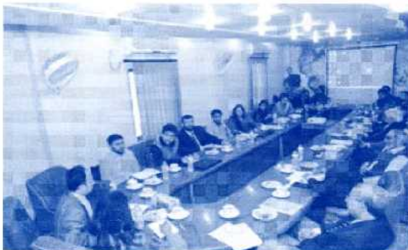
A view of Orientation Workshop participants.

Sindh Commerce & Trade Strategy 2016-2020 Launched for Stakeholders Consultation at the Business Talk Sustainability Meeting organized by Employers' Federation of Pakistan in collaboration with Industries & Commerce Department, Government of Sindh and Global Compact Network Pakistan