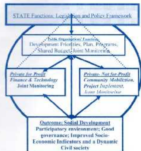
An Operational Model of PPP: Private Sector Engagement for Socio-Economic Development