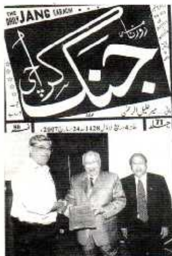
انجرو کیمیکل کی طرف سے پیش کردہ 'جنگری' نامی ایک نیا کارپوریٹ سوشل ریسپانسیبلٹی رپورٹ دنیا کی بہترین کارپوریٹ سوشل ریسپانسیبلٹی رپورٹوں میں سے ایک قرار دیا گیا ہے۔

KARACHI: United Nations Global Compact (UNGC) has placed Pakistan in top five countries of the world, which have submitted the notable Communication on Progress (COP).