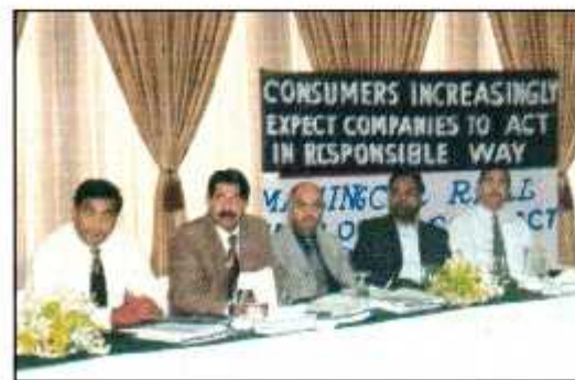
Participants engaged in serious listening