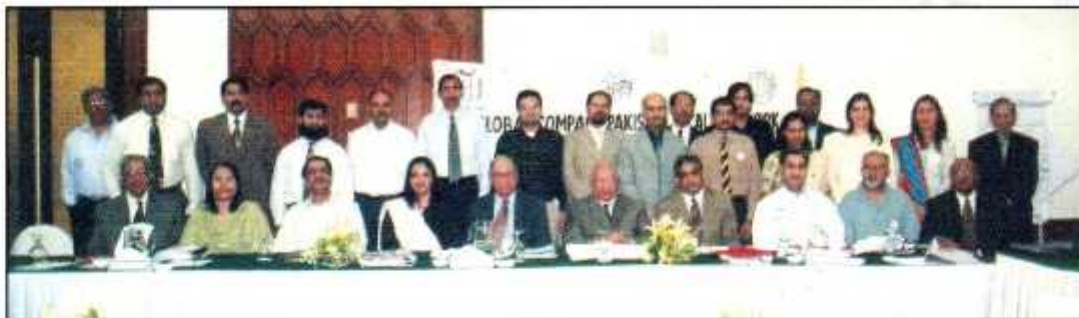
A Group photograph of participants